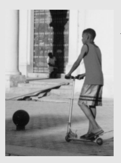
Navigating the Plaza Vieja's restored square on a scooter.