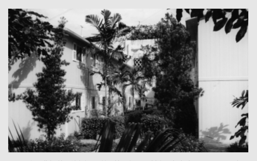
Just off the Plaza Vieja is transitional housing – prefabricated 2-bedroom apartments where residents wait for their homes to be completed. A 50-year-old woman who has lived there for one year applauds the restoration work: "It's good, and it's very ambitious – they are planning to go all the way through San Isidro." A man who lives there with his wife and two children is also pleased that he will continue to live in Old Havana: "I love it here. I grew up here, it is centrally located and I don't want to leave. But some who go to Alamar [apartment blocks east of Havana] say it's luxurious, they have houses with new flooring, glass windows, it's breezy and ventilated and cooler. And they are not living 8 to a room – people have their own rooms."