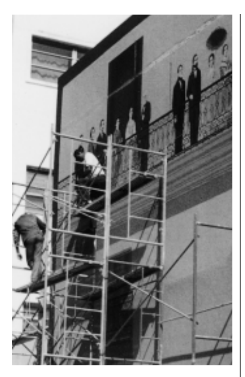
The finishing touches are put on a mural on O'Reilly street, commissioned by the Office of the Historian to decorate the blank back wall of an auto repair shop. Cuban artists worked 2 years on the project, which illustrates 67 figures from Cuban history using a medium of colored crushed stones coated in acrylic resin.