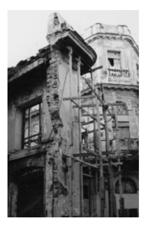
One of many collapsed buildings in Old Havana.

Judging from the limited discussion of the issue, it seems unlikely that Cuba's central government will soon devolve fiscal and other authorities to additional local entities. But as that and other debates proceed, visitors will continue to return to Havana to see skillful Cuban workers combining tourism earnings and hard human effort to save the memory and relics of their nation's past.