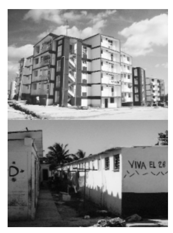
Relocated residents of Old Havana are in newly built housing in Alamar, a vast apartment complex overlooking the sea east of Havana. Lower photo: Before major restoration efforts began, other residents were relocated to small single-story apartments just across Havana Bay.

ousing is particularly difficult, an official said, because of overcrowding: "To work on a building of 20 units, we need 30 units of transitional housing." To prevent re-creating overcrowded conditions, some of the