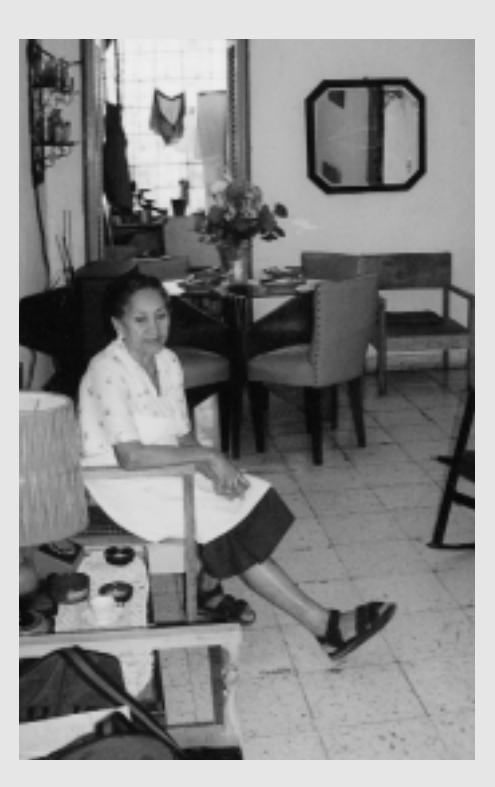
Renovated housing on the Plaza Vieja in the building shared with OHC offices.