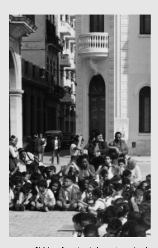
Children from local elementary schools converged on the plaza to see actors perform skits and quizzes on Cuban history. Behind them, the Gomez Vila building, built in 1909 and used as a post office, now being renovated as an apartment building for rental in dollars to foreign residents, managed by the OHC corporation Fenix.