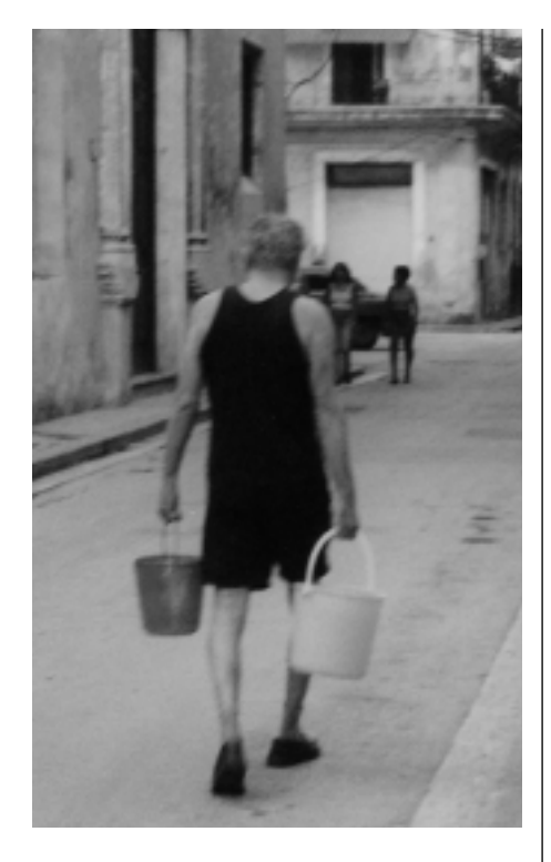
A 1996 survey found that 30% of Old Havana residents carry water into their homes every day.

Puerto Carenas , a construction company created in 1997, with 1,200 workers who build and restore historic buildings and monuments.