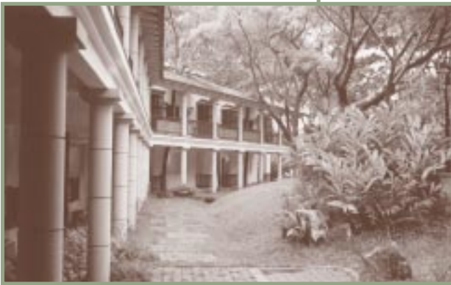
Las Terrazas, a mountain resort about 40 minutes' drive from Havana, is an example of nature tourism. Its hotel, shown here, is built into a mountaintop forest. A mainly European clientele mixes with Cubans to enjoy hiking, swimming in waterfalls, cycling, and exploring the ruins of a 19th century French coffee plantation.

Trinidad, a city on Cuba's southern shore, is a smaller, quieter place with cobblestone streets and a large area of historic buildings, mainly housing. Some local tourism revenue is recycled into local restoration, but not in such a complete way as in Havana. Because there are almost no large buildings that could, if restored, serve as hotels, Trinidad has many private entrepreneurs who rent rooms in their homes to tourists.