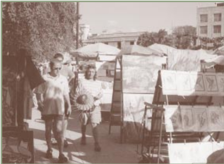
A private art market in Old Havana provides income for artists and vendors and tax revenues for the neighborhood's restoration.

In a quiet Havana neighborhood, a retired couple has been renting two rooms in their home since 1996. They get their clients from word-of-mouth and referrals from an informal neighborhood network of renters. They also have substantial return business.