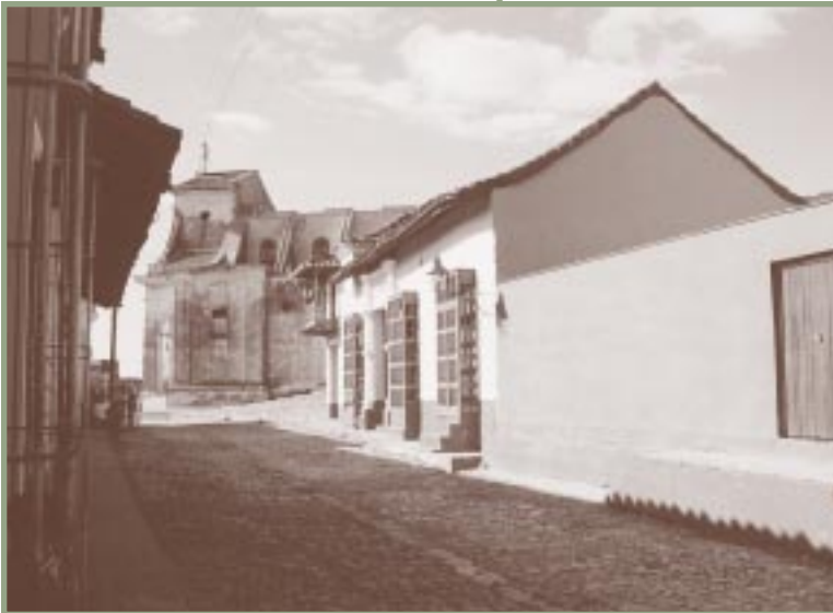
Old Havana and the southern coastal city of Trinidad are two centers of colonial architecture that are undergoing restoration and attracting tourists.

If tourism is socialist Cuba's first major brush with globalization, the results have not all been positive. The economic downturn of 2001 and the travel scare that followed the September 11 terrorist attacks combined to stop the growth of Cuban tourism in 2001 and 2002, preventing Cuba from reaching its projected